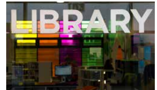
Main picture: The teen space works in contrast to the children's area, and has a very modern feel with great design aspect. Bespoke black and green Cocoon furniture and high backed sofas make the space feel like a home from home. Top right: Council members and Denny residents try out the Cocoon! Bottom row: An overview of the teen space is in the corner of the library where a PC bank is also readily available for all users.