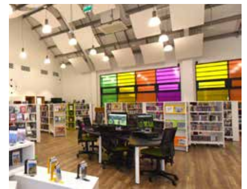
Main picture and top right: Soft seating can be found in all areas of the library, encouraging visitors to take a seat, make themselves comfortable and enjoy their surroundings. Middle and bottom right: Colour is even added to the windows which sees the library filled with a colourful glow when the sun streams through.