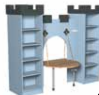
Ice blue [3]