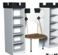
Traffic white [1]