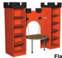
Flame red [2]