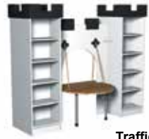
Traffic white [1]