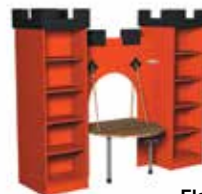
Flame red [2]