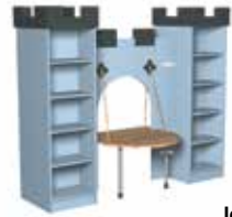
Ice blue [3]