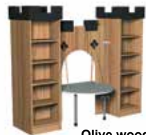
Olive wood decor [4]

Please add selected colour code to the last digit of the Order No.