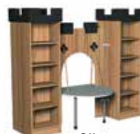
Olive wood decor [4]