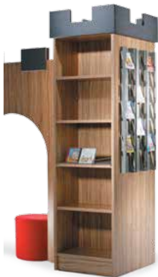
Pic. shows 3 CD displays.

Available colours and designs on wheels see page 58.