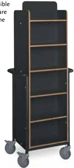
XL PLUS EXHIBITION

Capacity approx. 100 standard volumes. Size W1010 x D430 x H1090 mm.