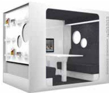
Cocoon Working-Lounge Exclusive

Create a zone for students and work groups with the Cocoon Working-Lounge.