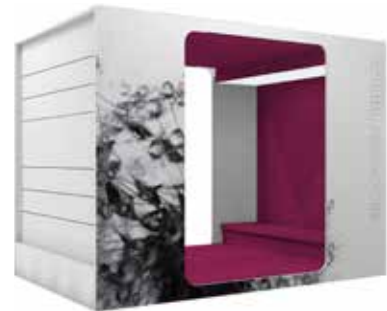
Cocoon Kids-Lounge XL