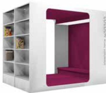
Cocoon Kids-Lounge L

Two models are available - L and XL - depending on if seating is required in both sides of the Lounge. Add graphics to the sides of the Lounge to create just the right atmosphere.