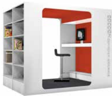
Cocoon Computer-Lounge L

Depending on choice of model, you can use the exterior surfaces for display on the high gloss display panel or steel shelves. You can also install browsers and many other function from the Ratio shelving system for both storage and display in the module with two bays.