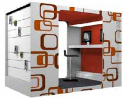
Cocoon Computer-Lounge XL