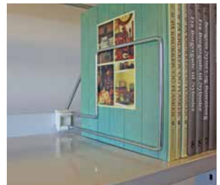
Laterally reversed model shelf depth 30 cm