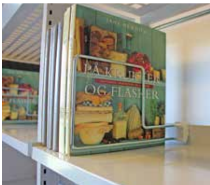
Standard model shelf depth 30 cm

Examples of various versions of the backedge book support: