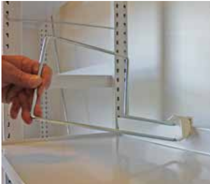
Place the plastic fitting on the back edge

The backedge book support is to be mounted on the backedge of the shelf by placing the plastic fitting on the backedge and pressing with the palm of your hand, until it is firmly fixed.