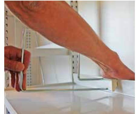
Press until firmly fixed (you will hear a loud click)