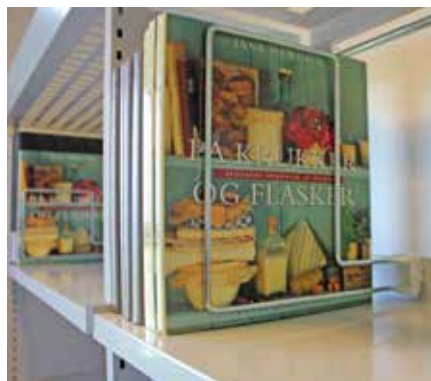
Standard high model