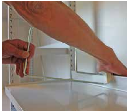
Press with the palm of your hand