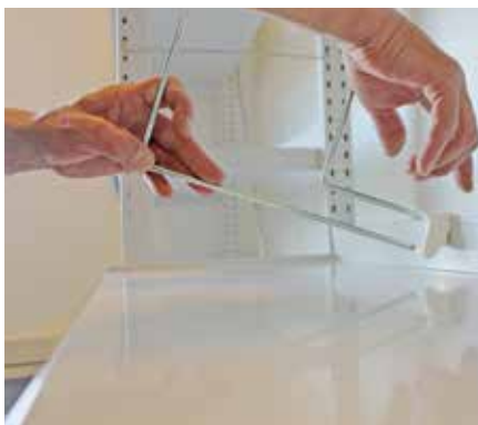
Raise the front of the frame approx. 10 cm