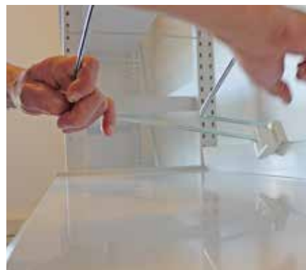
RIGHT (towards the plastic fitting)