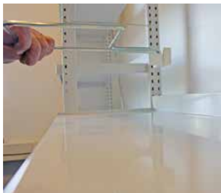
The book support is dismounted

Only dismount the book support when absolutely necessary, as the plastic fitting is exposed to wear and tear every time the book support is mounted and dismounted.